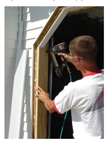
STEP 3: Measure, Cut & Apply Aluminum Jamb Cover Header

Plywood may be ripped for use as the filler.